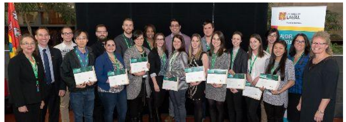
The Research Day winners (photo taken by Jean-Fran ois Rivard)

For more information see the complete summary of the Research Day 2016