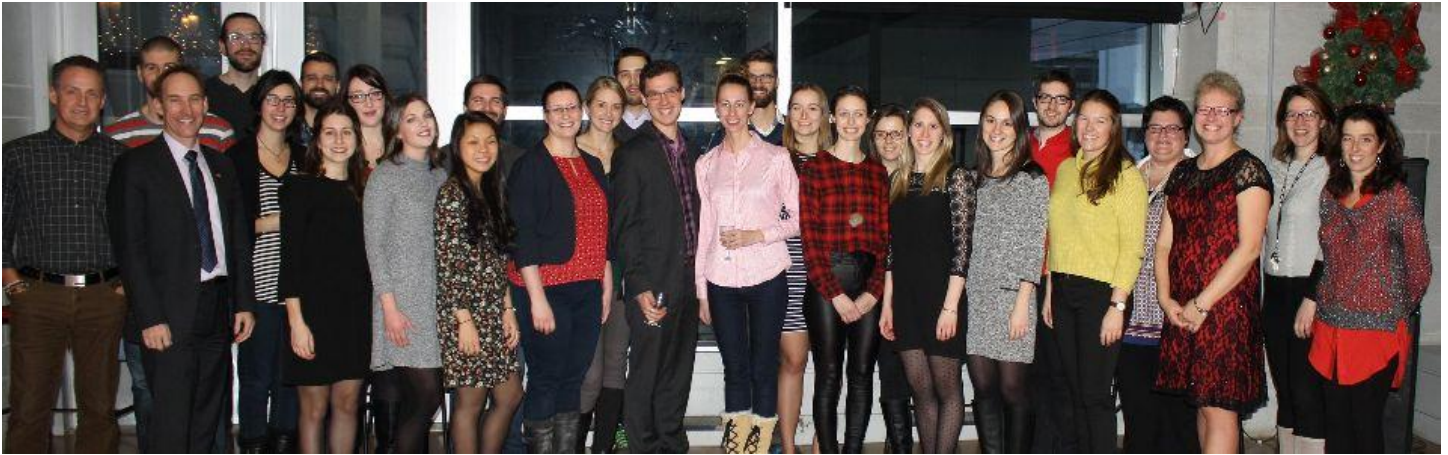
Master in advanced pharmacotherapy program

Twenty-one residents completed the Advanced Medication Master's program in mid-December 2016. An end-of-program cocktail was held on December 16, 2016 to celebrate the event, thanks to the involvement of Servier Canada. We would like to thank all pharmacists, professionals and professors who participated in their training. Congratulations to the graduates and good success to all of you for the future! We also wish the residents of the 2016-2017 cohort (who are currently on an integration course in the various healthcare establishments) to be very successful.