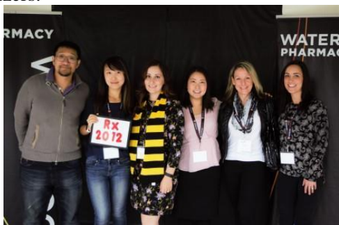
Photo: students at Reunion

2016 was the fifth year since Waterloo Pharmacy graduated its first cohort. To celebrate we hosted our first reunion, an event which drew graduates from across the country. Reunion featured a continuing education session which covered current topics in pharmacy practice like the Zika virus and pharmacists as immunizers.