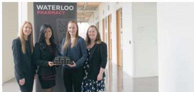
Photo: Four Pharmasave award winners