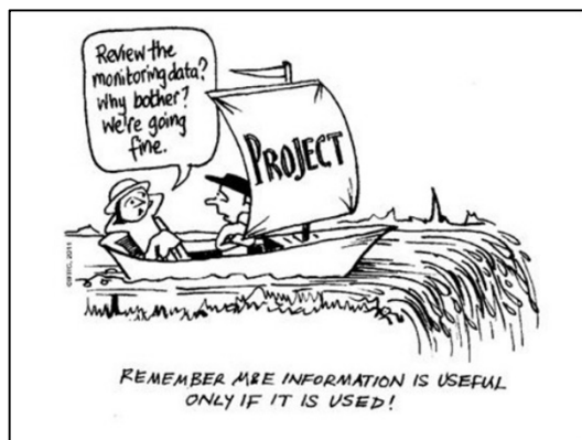
From: archive.constantcontact.com Centre for Research in Applied Measurement and Evaluation