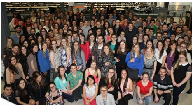
First Pharm.D. graduates

The first cohort from the new Pharm.D. program completed courses and internships during the summer of 2015. After 4 years of efforts, 162 students graduated. A second cohort will graduate this summer. Again this year, we have received more than 1800 applications for admission in this program, which welcomes only 192 new students every year. This program is now well established, but the Faculty of Pharmacy is, of course, committed to a continuous improvement of it. Thus, a program evaluation is ongoing and we are pleased to obtain comments and feedback from our students after every session.