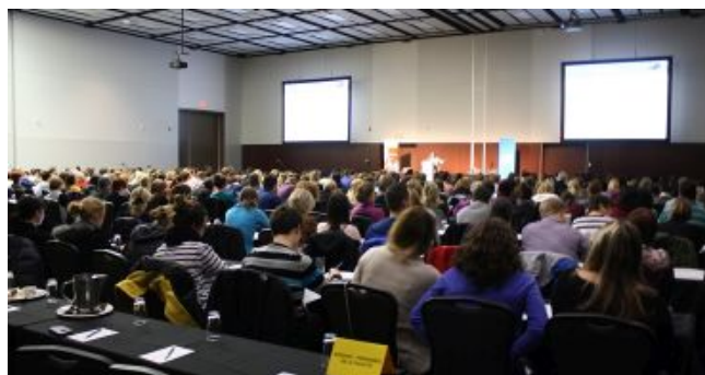
Annual Symposium of the Faculty held on October 28 th , 2015