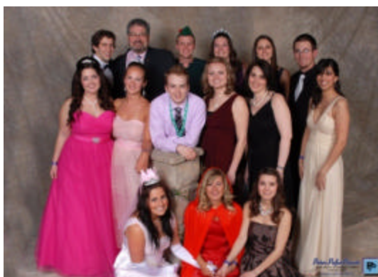
PDW 2011 Executive Planning Committee

The CAPSI student body of the College hosted the annual CAPSI Professional Development Week (PDW 2011) in Saskatoon from January 12-15. The theme was “Wide Open Future,” acknowledging that the possibilities for pharmacists are as endless as the Saskatchewan horizon! Recognized as one of the largest gatherings of the profession, this conference was well received with approximately 600 students in attendance, representing all the schools of Pharmacy