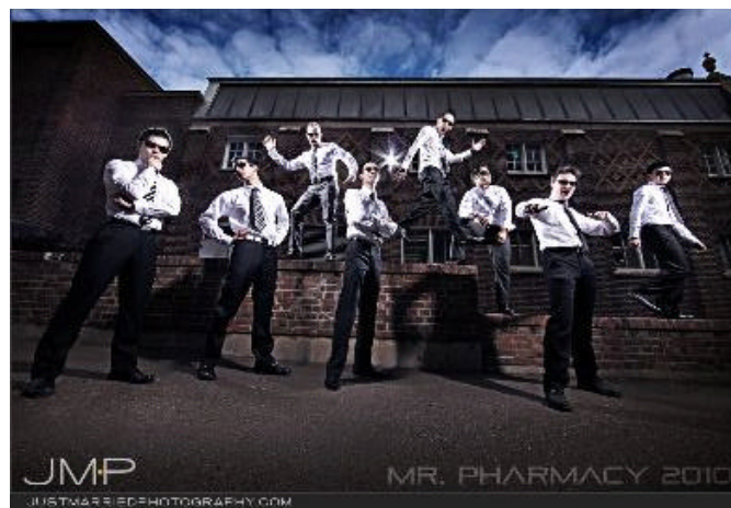
"Mr Pharmacy"

APSA was thrilled with the response and support for this event and is already looking forward to Mr. Pharmacy 2011!